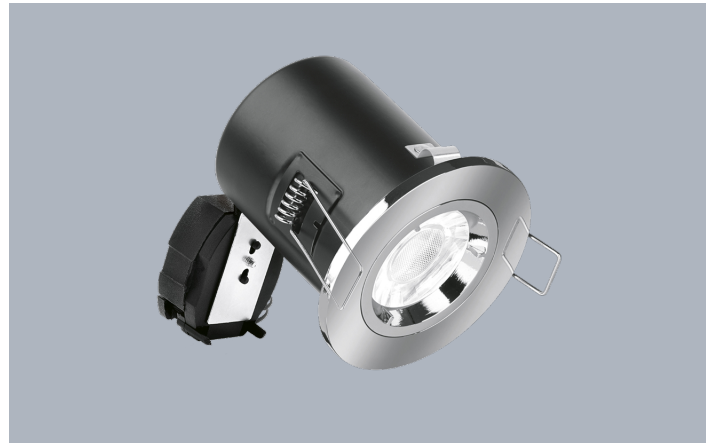
EFD™ GU10 Fixed Lock Ring Aluminium Fire Rated Downlight