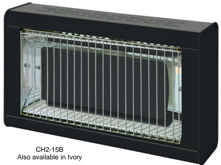
CH2-15B Also available in Ivory