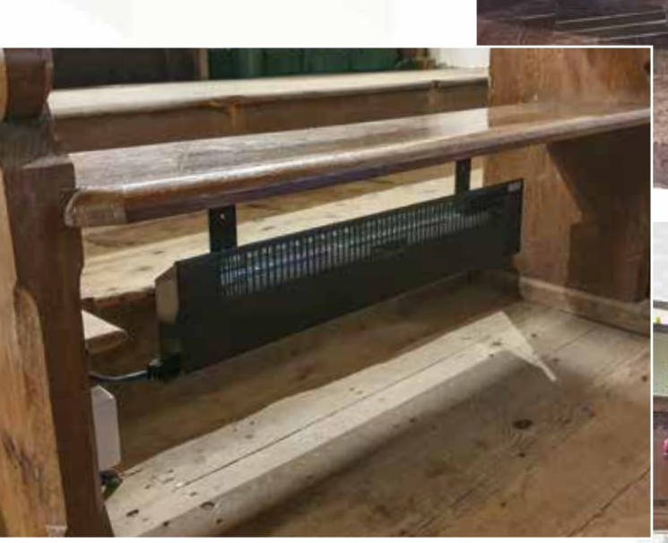
Pew heaters keeping a congregation warm in a Norfolk Church

Pew heaters in a Gloucestershire church installed with suspension brackets