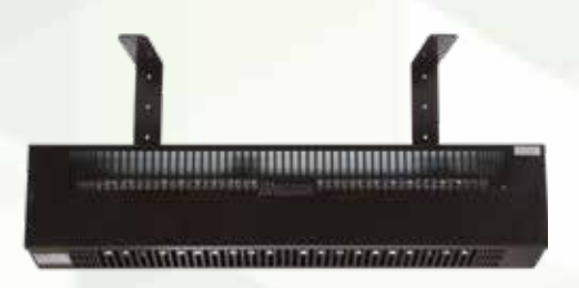
PHB optional suspension brackets