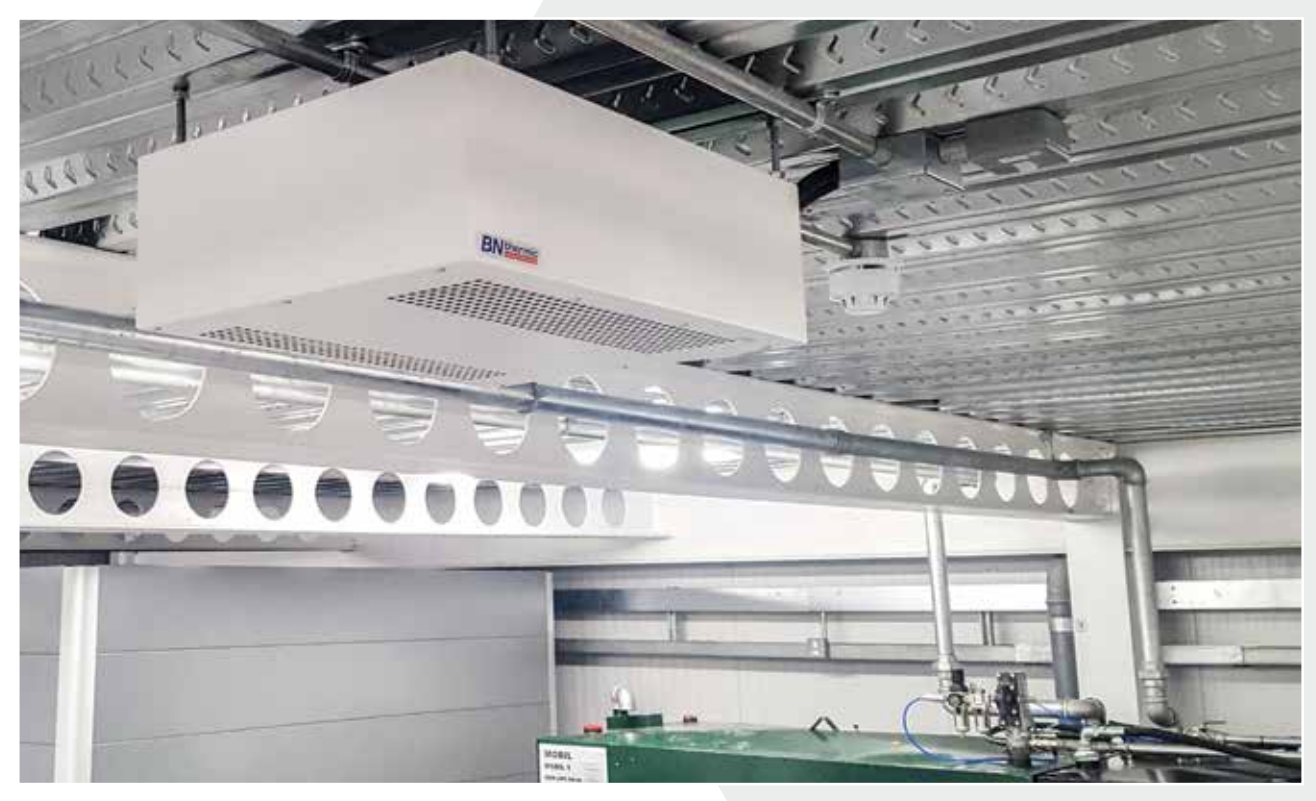
The rugged SMH is well suited to industrial applications