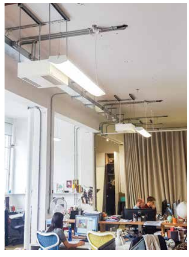
SMH heaters: ideal for an open plan office