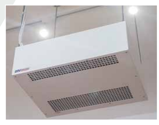
SMH heater suspended from drop rods