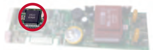
ETCO - Electronic Triac Control Optimiser.

ETCO micro processor is the latest technology in electric control consumption. This electronic optimiser actually manages and restricts the flow of electricity to the heating elements on the basis of the information taken from the thermostat.