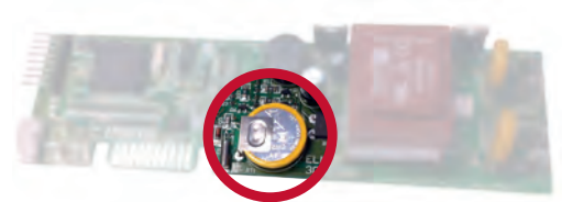
5-year memory back up device.

This feature is key if RXE-Plus is disconnected. This exclusive characteristic will prevent loss of programming due to accidental disconnections, forced disconnections during summer and programmed disconnections by the action of external accessory devices.