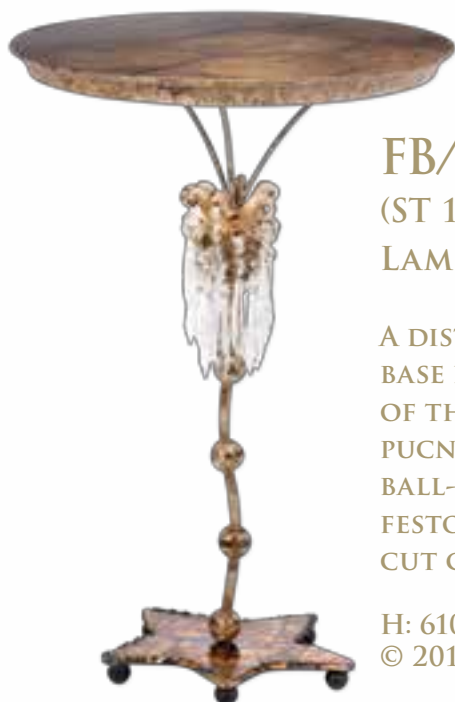
FB/VENETIANTABLE (ST 1060) ROUND LAMP TABLE

H: 870MM W: 890MM D: 380MM © 2003 PAUL GRÜER