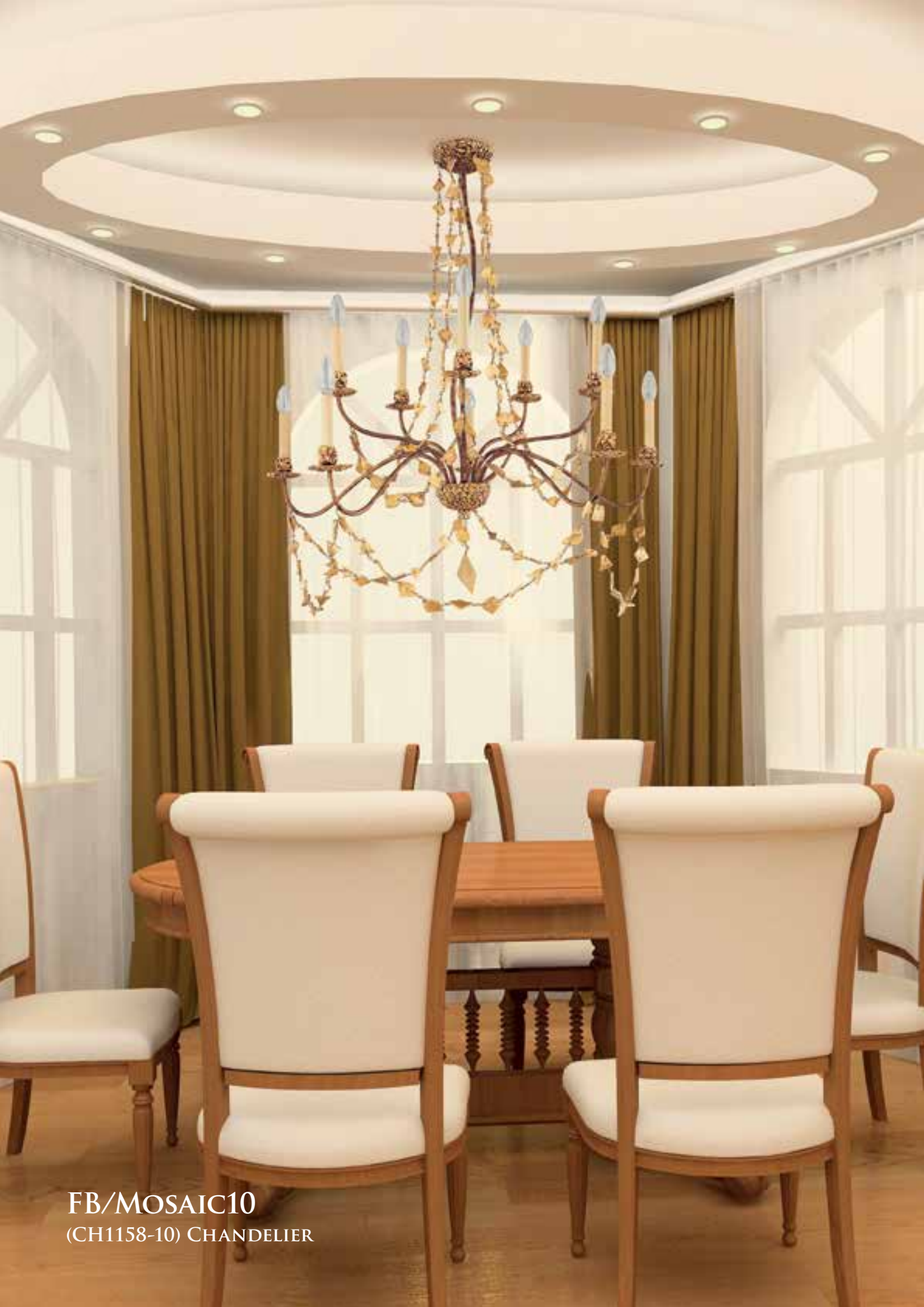
FB/MOSAIC10 (CH1158-10) CHANDELIER