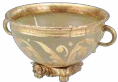
FB/ISABELLA BOWL (SI 1148) DECORATIVE BOWL

ANTIQUED GOLD AND SILVER LEAF BOWL ON GOLD LEAF SCROLLED FEET.