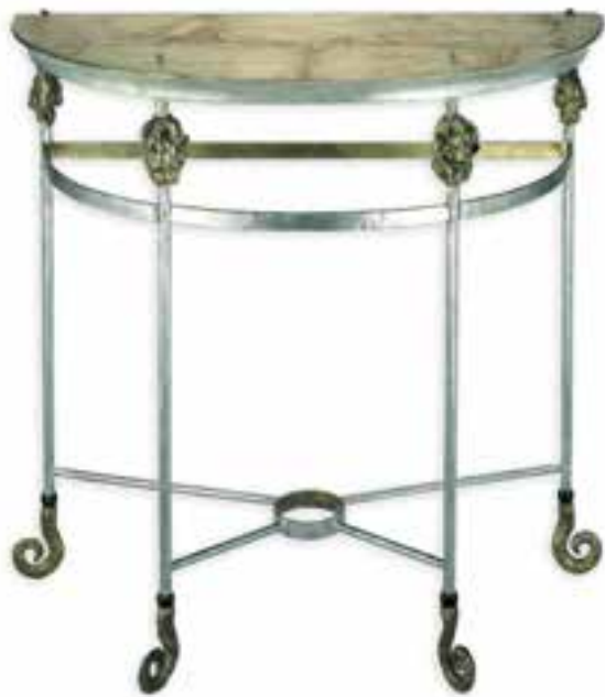
FB/ARMORYTABLE (CON 1050) DEMI-LUNE CONSOLE TABLE

GOLD LEAF AND GLAZED DEMI-LUNE TABLE TOP WITH SILVER AND GOLD LEAF SCULPTED DECORATIVE FACE FRAGMENTS ON LEGS, GILDED SWIRL FEET.