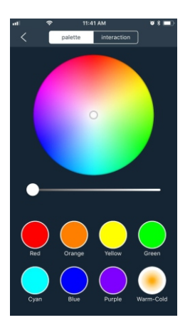
Fig. 6 - RGB Mode

5. RGB Mode - Tap the "Control" button to enter Palette RGB mode. You can adjust both the colour RGB (Red, Green, Blue) as well as the brightness of the colour. There are 7 preset colour buttons for easy access to the individual channels (Fig. 6).