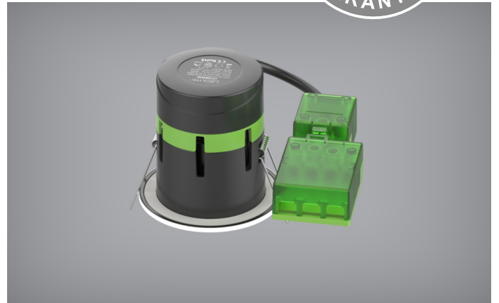
LOOP IN/OUT CONNECTOR