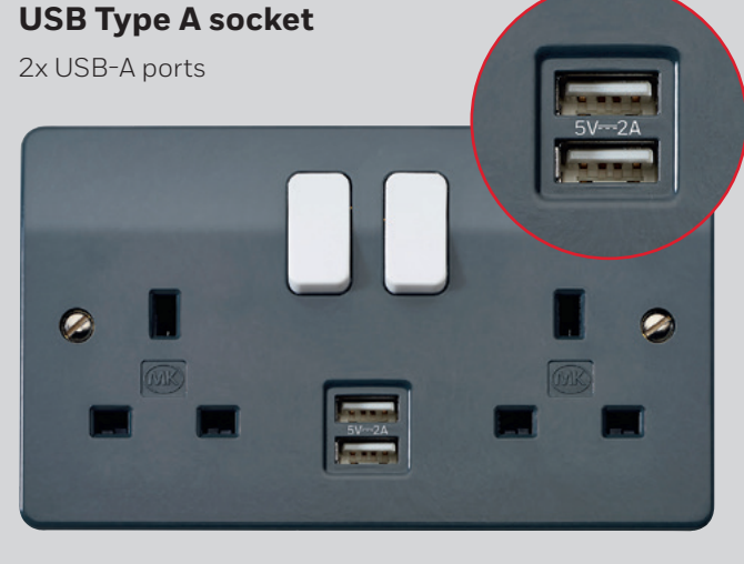
Logic Plus<sup>™</sup> - Graphite (Type A Socket available various ranges and finishes)