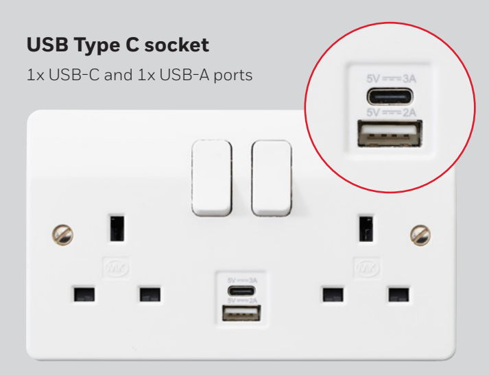
Logic Plus<sup>™</sup> - White (Type C Socket available in White and Graphite only)