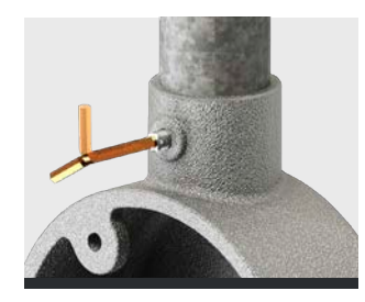
Fast-fix solution Ideal for major projects where cost & safety are critical