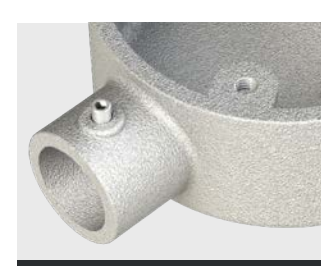
Fully galvanised system Offering greater corrosion resistance