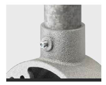
No need to thread conduit tube With Conlok's unique built-in grub screw