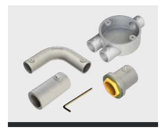
Full range of accessories All of the essential items for quick installations