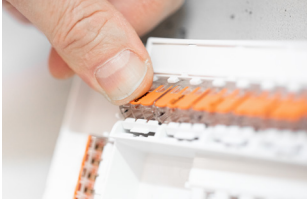
Snap the connector into the holder.