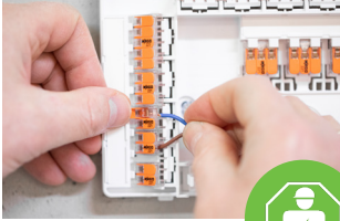
Insert the conductor.