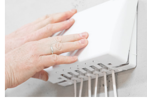
Snap on the cover.