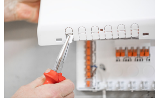
Break the cable entry out of the cover.