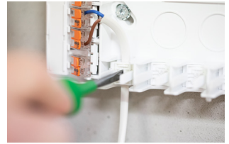
Insert the cable into the strain relief.