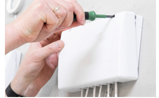
Snap off the cover.