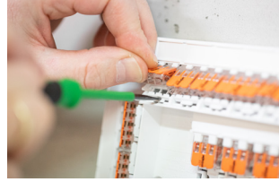
Release the connector from the holder.