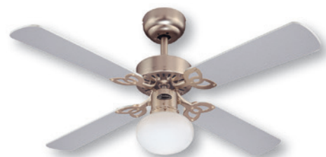
light maple/ silver

Electricity consumption/year: ..... 12,77 kWh RPM: ..... 210/162/110 Wattage: ..... 47.4/39.6/37 Noise level: ..... 47,9dB(A) Motor size: ..... AC Motor 153 x 9 mm Lamp socket: ..... 1 x E 27, max. 60 W (not included) Maximum fan flow rate: ..... 108,59 m 3 /min Blade pitch: ..... 11° Max. ceiling pitch: ..... 13°